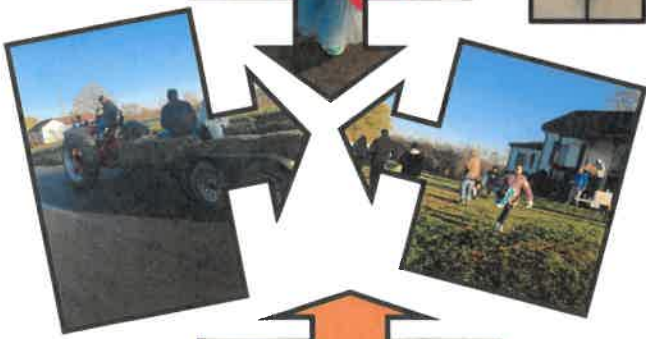
HALLOWEEN Dawn Neely