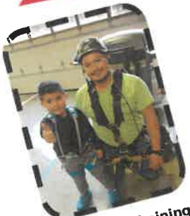
Father & Son Training