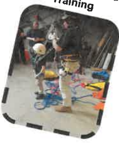
Grandfather & Grandson Training